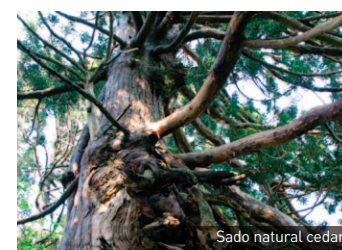
Sado natural cedar