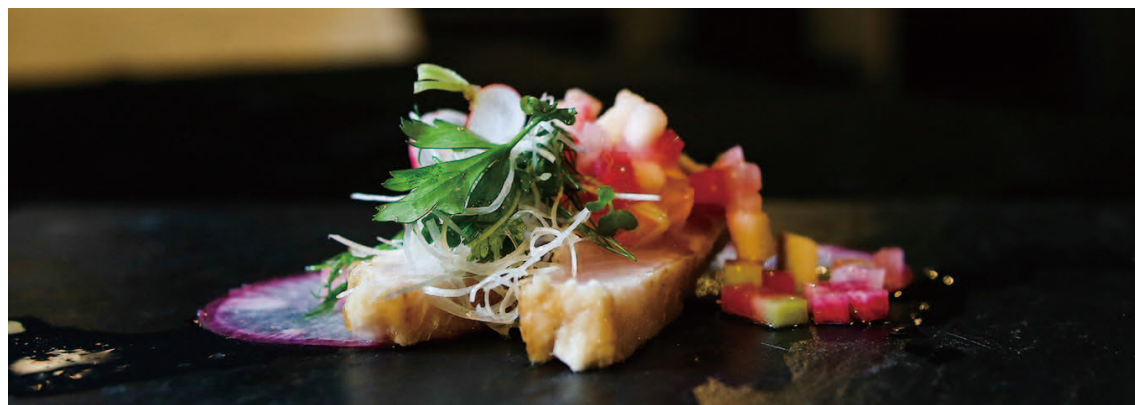
La Plage Address / 978-3 Kubota, Sado City[Inside Hotel Urashima East Bldg.] TEL: 0259-57-3751 Opening hours / 11:30 - Last order at 14:00 17:30 - Last order at 20:30 Holidays / Sometimes closed at short notice

Soba Mozem (reservations required) is famous for its Juwari soba handmade by the owner. Look forward to wonderful courses including soba and seasonal fare.