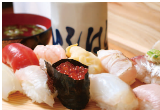
Ishihara Sushi Address / 192-2 Ryotsu Ebisu, Sado City TEL: 0259-27-2658 Opening hours / 11:00-14:00 and 17:00-23:00 Holidays / Tuesdays