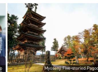
Myosenji Five-storied Pagoda