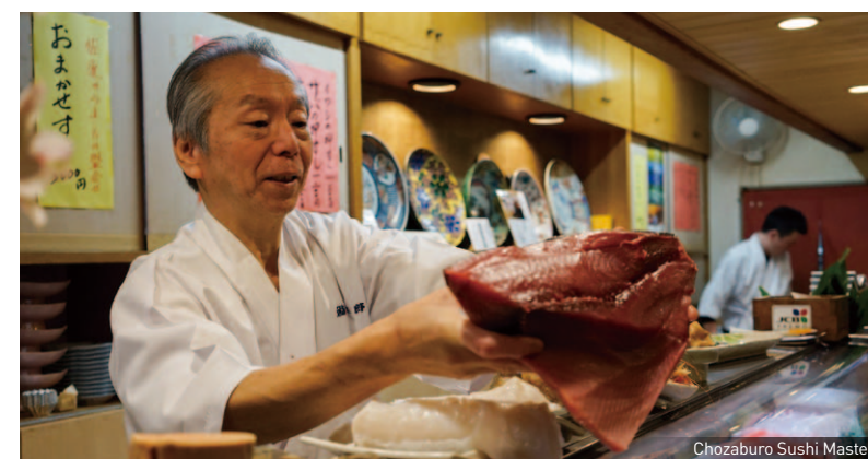
Chozaburo Sushi Master