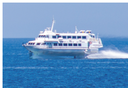
Jetfoil Ginga / Tsubasa / Suisei