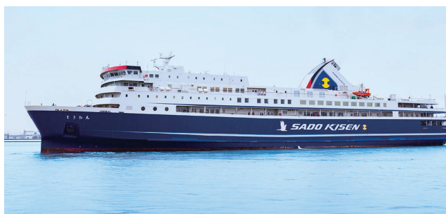
Car ferry Tokiwamaru

You can go from Niigata Port to Ryotsu Port and then make your way to Ogi Port back to Naoetsu Port (and vice versa) so you can choose your way of transportation.