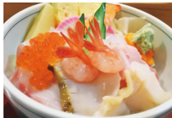
Chozaburozushi Address / 81-4 Niibo, Sado City TEL: 0259-22-2125 Opening hours / 11:00-22:00 Holidays / 1st, 3rd and 5th Sunday of each month 2nd and 4th Monday of each month