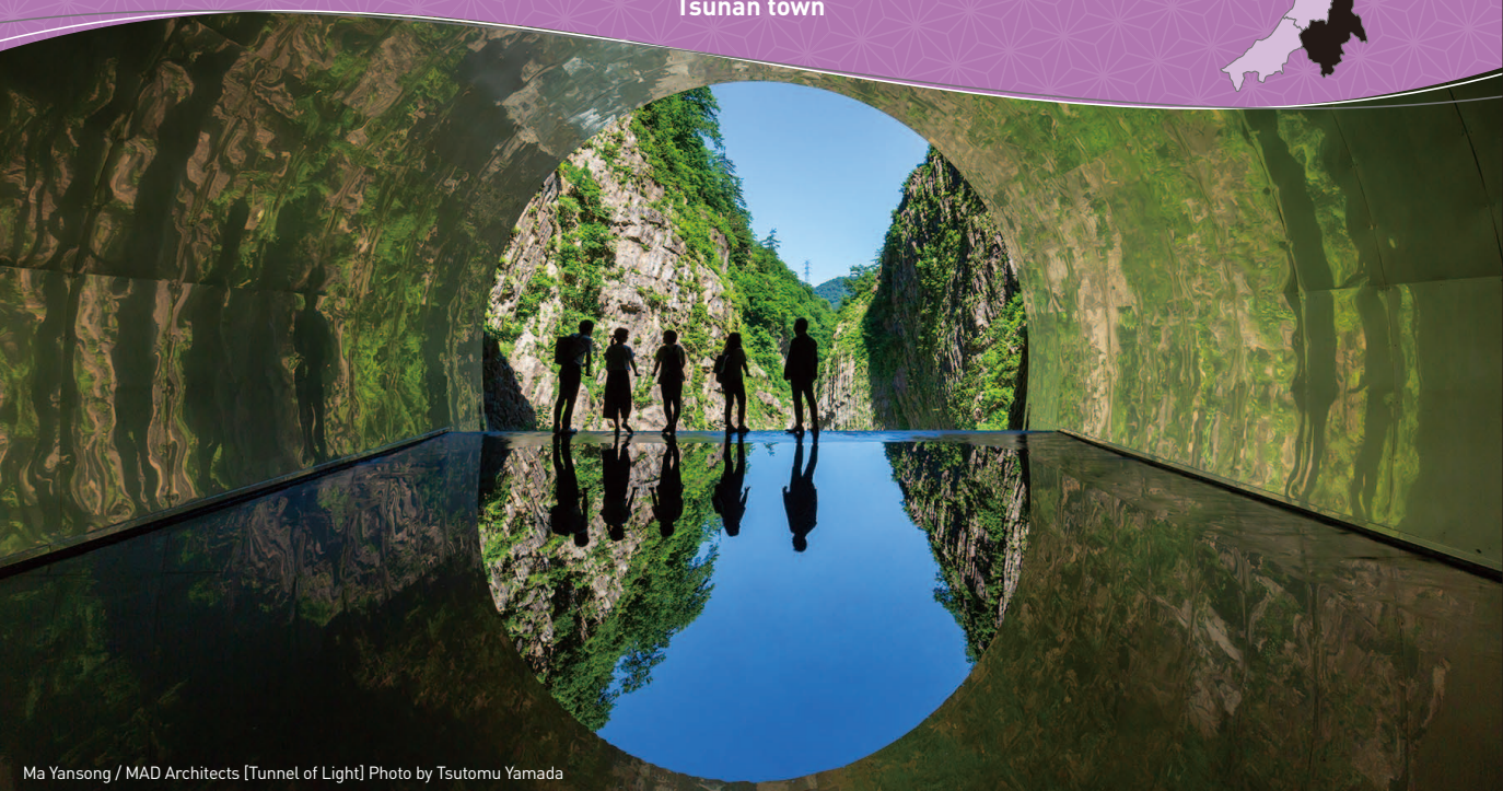
Ma Yansong / MAD Architects [Tunnel of Light]