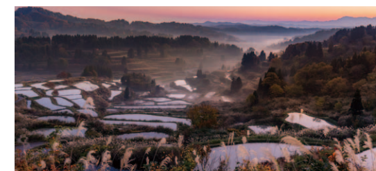
Tokamachi Tourist Association