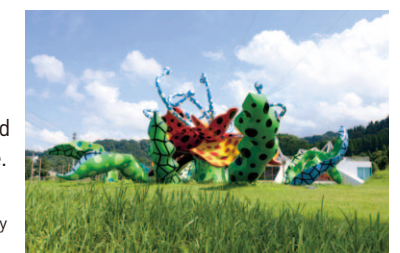
Yayoi Kusama [Tsumari in Bloom]

Address / Echigo Tsumari Satoyama Museum of Contemporary Art, KINARE, 6 Honcho, Tokamachi City TEL: 025-761-7767 (Echigo Tsumari Art Field Information Center)