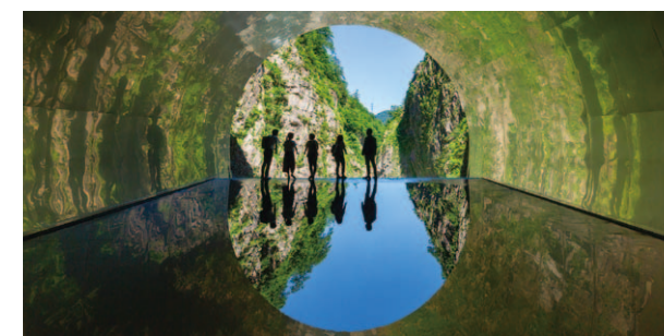
Ma Yansong / MAD Architects [Tunnel of Light]

*Fee is charged (Varies according to the exhibition)