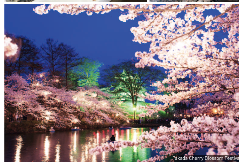
Takada Cherry Blossom Festival