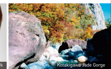
Kotakigawa Jade Gorge