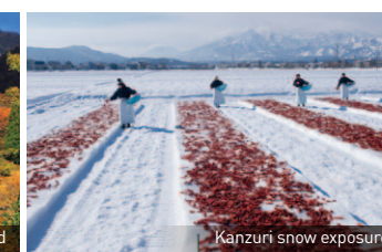
Kanzuri snow exposure