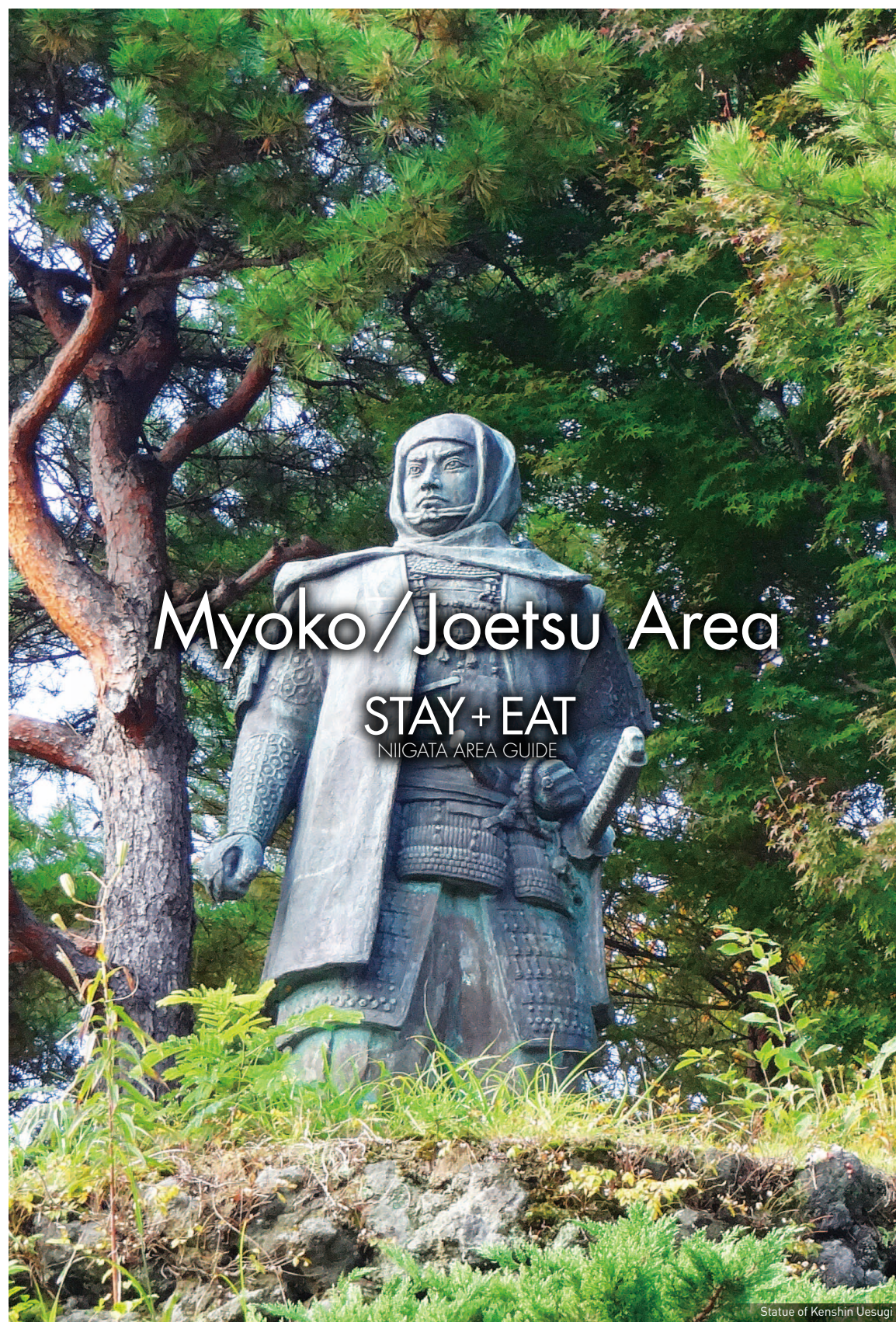
Statue of Kenshin Uesugi