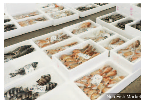
Nou Fish Market